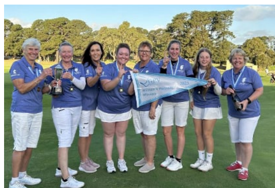
2023 Pennant Winners - Mornington Golf Club

Division One Runners-Up - Cardinia Beaconhills Golf Club