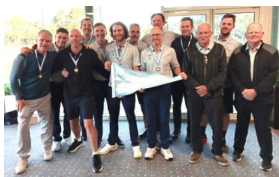
2023 Pennant Winners - Devilbend Golf Club

Division One Runners-Up - Moonah Links Golf Club