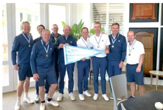
2023 Pennant Winners - The National Golf Club

Division One Runners-Up - Moonah Links Golf Club