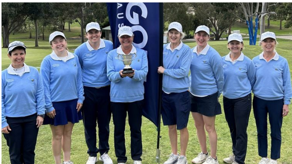
The 2023 Golf Peninsula Vic. Country Week Women's Team - 2023 Winners